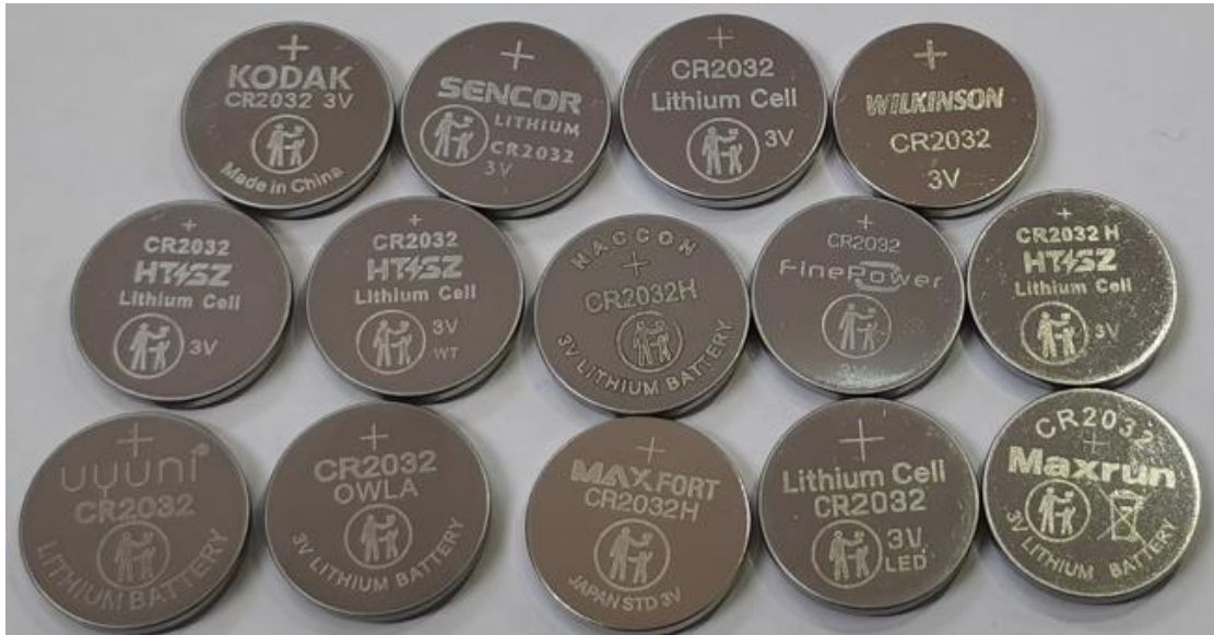
Cell/电芯 (CR2032 3,0V 210mAh)