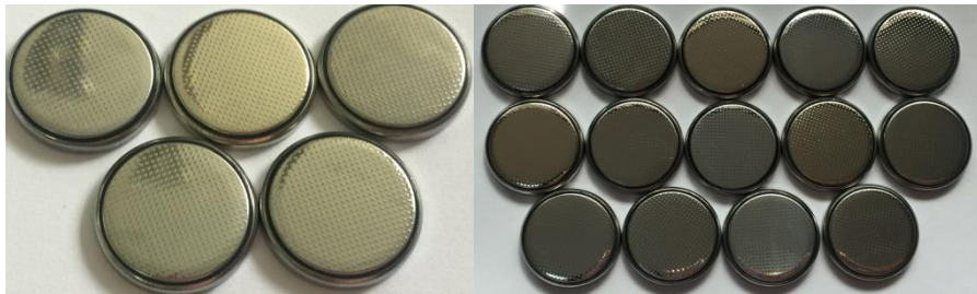
Cell/电芯 (CR2032 3,0V 210mAh)